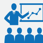
Workshops and Assessments